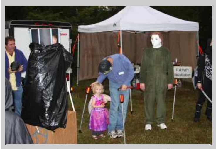
Costume Winners, Adult - Telescope dude, Child - Fairy

A few souls stuck it out and stayed Sunday evening and were