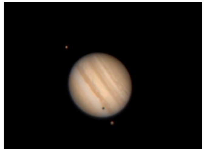
This image, taken by BBAA member Chuck Jagow, nicely illustrates a shadow transit.

The Galilean satellites regularly pass in front of or behind Jupiter. Four different events can occur: (1) a satellite transit, when one of the moons passes in front of Jupiter's disk from our vantage point, (2) a shadow transit, when a moon casts a shadow on Jupiter, (3) an eclipse, when one of the moons temporarily hides in Jupiter's shadow, and (4) an occultation, when Jupiter's disk obscures our view of the given moon. Typically these events will come in pairs (either the first two or the last two together), though not necessarily. On rare occasion, it is possible for as many as three of the Galilean moons to transit simultaneously, as recently seen on January 24, 2015 (the next such occurrence will not be until March 20, 2032).