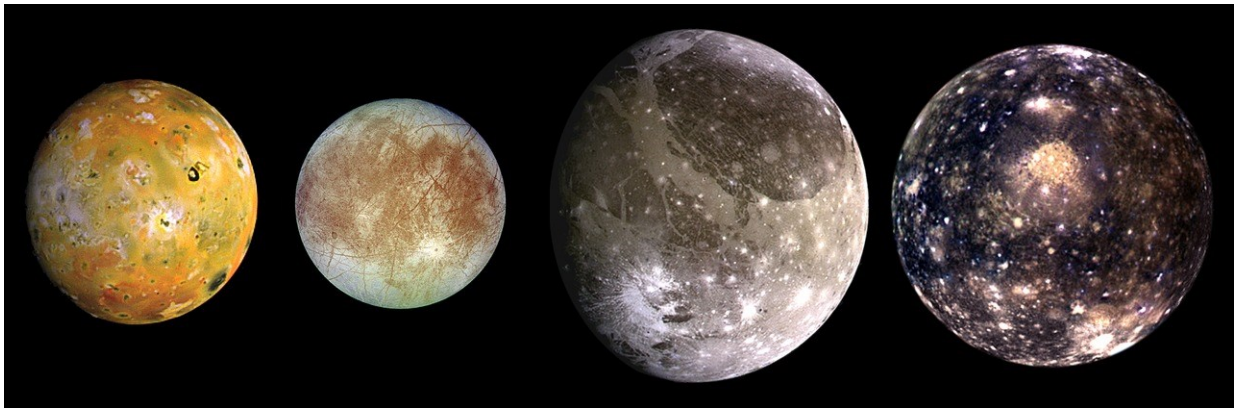
The four Galilean Moons of Jupiter in order of increasing orbital distance from Jupiter: Io, Europa, Ganymede and Callisto. These images were taken by NASA's Galileo spacecraft. Named in honor of the discoverer Jupiter's four largest Moons, the mission was a huge success, finding, among other things, evidence of subsurface saltwater on Europa, Ganymede and Callisto and recording the intensity of volcanic activity on Io. (NASA)

The inner two Galilean moons are a “fire and ice” duo. Spurred by the gravity of Jupiter, Io has over 400 active volcanoes. Europa, on the other hand, features a highly reflective icy surface, marked by cracks. Europa displays few craters, the signs of a young surface. Most notable, perhaps, are the liquid water oceans thought to exist underneath. Of all of the Solar System bodies, it is thought to have the greatest potential for harboring extraterrestrial life.