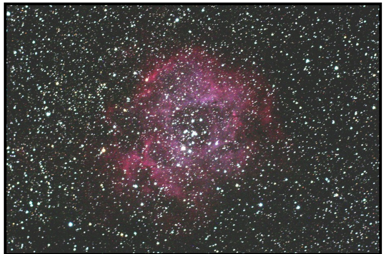
The Rosette Nebula (NGC 2237). Feb. 8, 2015, Canon 20Da, 400mm f/6, 208 sec exposure, ISO 1600.