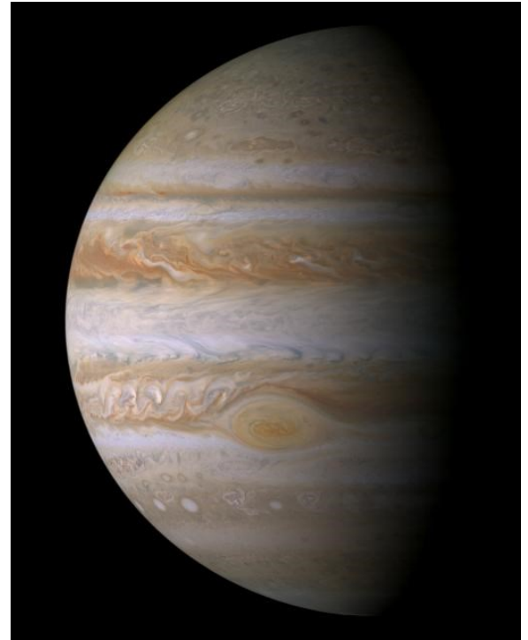
Jupiter taken by the Cassini spacecraft in 2000.

Jupiter is typically the third brightest object in the night sky (after the Moon and Venus), with a peak apparent magnitude of -2.94. Though large in size, the planet has a rotation rate of just 10 hours. The resulting centrifugal forces (directed outward) are responsible for the planet's equatorial bulge. Jupiter's equatorial radius is actually 7% greater than its polar radius, a characteristic noticeable to keen-eyed observers.